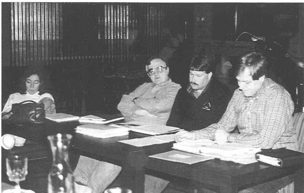
Officers at work: LWSA officers apparently taking a short nap during one of the recent meetings.